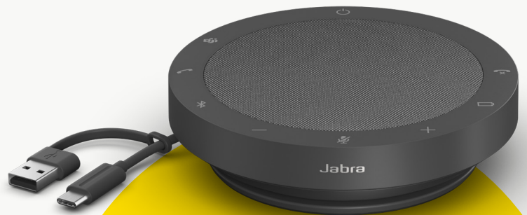
MS TEAMS & UC VARIANTS

We consider sustainability carefully at every stage of product development. The casing of Speak2 55 is made with over 50% sustainable materials**, and has a number of built-in parts that can be repaired or replaced. Better sustainability = longer speaker life = great calls for you and your team for years to come.